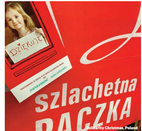
Solidarity Christmas, Poland