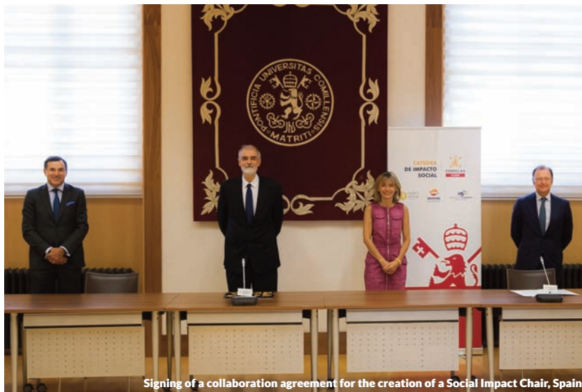
Signing of a collaboration agreement for the creation of a Social Impact Chair, Spain

In addition to providing a forum for thought and debate as well as expert training for professionals, the Chair, which is linked to the Economic and Business Studies Department at Universidad Pontificia Comillas, will create a Social Impact Laboratory that will be a pioneering think tank in Spain. This Laboratory will bring together a group of experts to reflect on both the future of investment and the measuring of its contribution and associated risks, and to create a white paper on the subject.