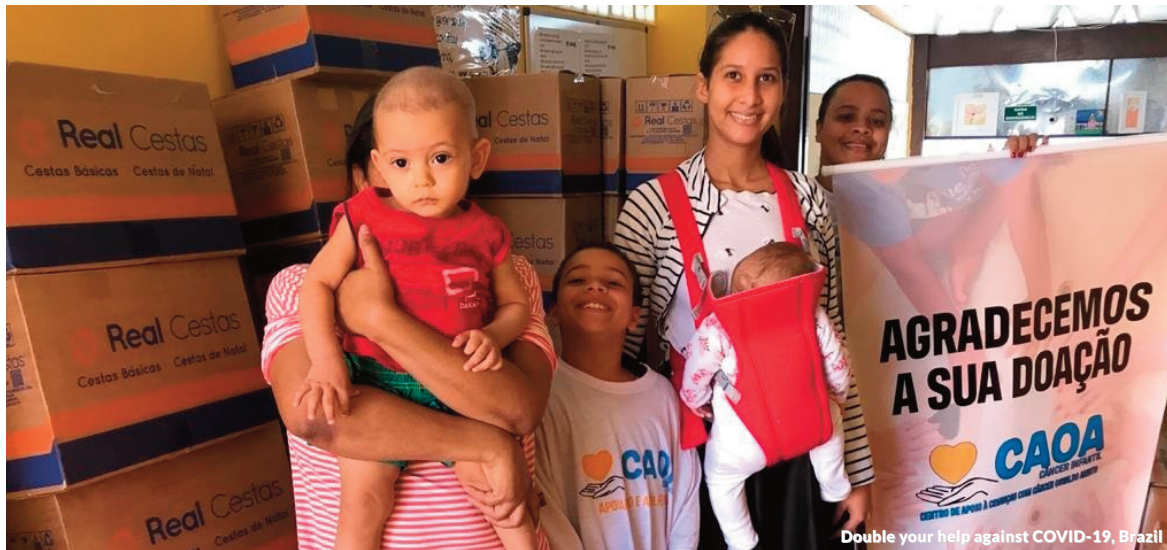
Double your help against COVID-19, Brazil