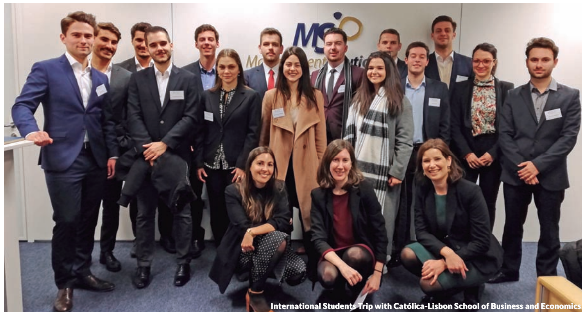
International Students Trip with Católica-Lisbon School of Business and Economics