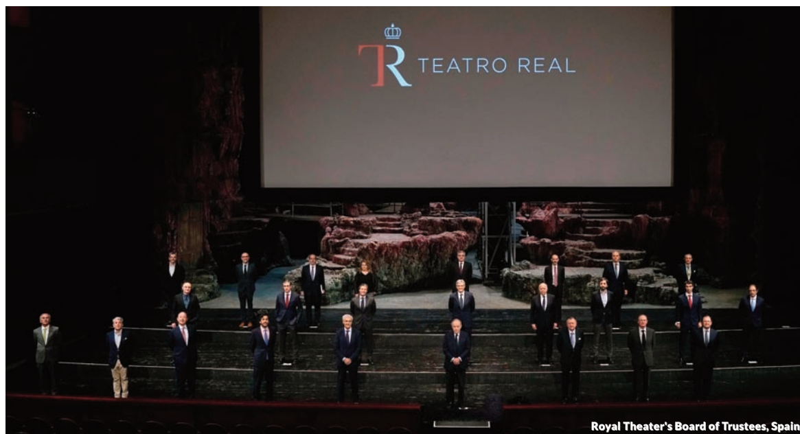
Royal Theater's Board of Trustees, Spain

Additionally, Management Solutions has collaborated with the Friends of the Royal Theatre Foundation for the fourth consecutive year. The foundation is established to support, promote and develop the Royal Theater's cultural activities and projects.