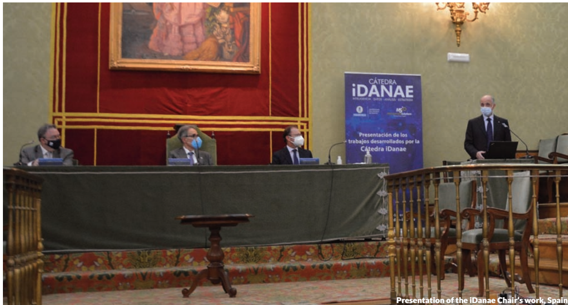
Presentation of the iDanae Chair's work, Spain

Lastly, the 4Q20 publication is focused on causality in the field of Machine Learning models, and its impact on the development of these models, deepening into the importance of the application of causality knowledge to artificial intelligence to achieve models with an improved capacity for generalization, so that spurious and biased relationships are ruled out.