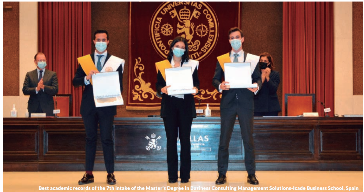
Best academic records of the 7th intake of the Master's Degree in Business Consulting Management Solutions-Icade Business School, Spain

Also, since 2019 Management Solutions teaches a training program for senior professionals in the Brazilian office in partnership with the Insper Institute, one of the most prestigious higher education institutions in Latin America, offering commercial management and marketing content applied to financial services, digital transformation and problem solving.