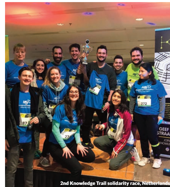
2nd Knowledge Trail solidarity race, Netherlands

Het Gehandicapte Kind is a foundation for disabled children that aims to promote and support initiatives that will contribute, both with actions and economically, to the integration of these children into society.